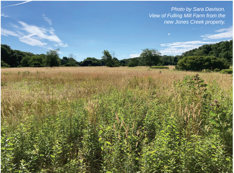
View of Fulling Mill Farm from the new Jones Creek property.

In 2022, the Trust and the Town of East Hampton, using private and CPF (Community Preservation Funds) purchased a 2.7 acre property on Jones Creek and adjacent to the 17-acre Nature Conservancy Fulling Mill Farm Preserve, creating a bridge from the preserve to the pond. This acquisition not only prevents more nitrogen, sediment, and other contaminants from entering the pond, but protects a mature oak forest that provides an important ecological link from the pond to the larger Fulling Mill Farm Preserve which is managed as a meadow for wildlife including pollinators.